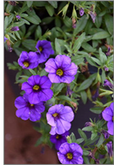
Aloha Kona Midnight Blue Calibrachoa flowers

Aloha Kona Midnight Blue Calibrachoa is recommended for the following landscape applications;