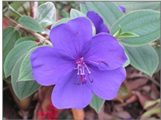
Princess Flower flowers

Princess Flower is recommended for the following landscape applications;