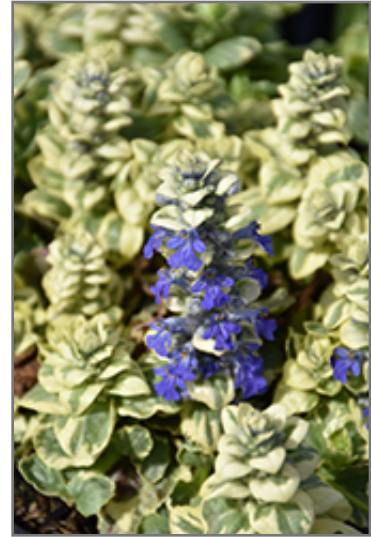
Silver Queen Bugleweed flowers

Silver Queen Bugleweed is a dense herbaceous evergreen perennial with a ground-hugging habit of growth. Its medium texture blends into the garden, but can always be balanced by a couple of finer or coarser plants for an effective composition.