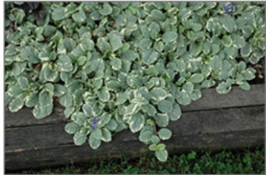
Silver Queen Bugleweed