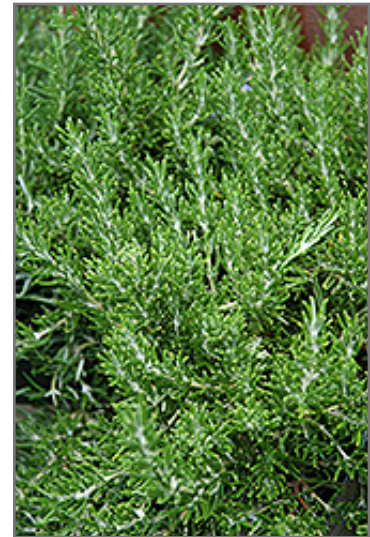
Roman Beauty Rosemary foliage