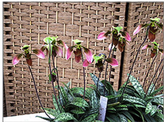
Appleton's Orchid in bloom