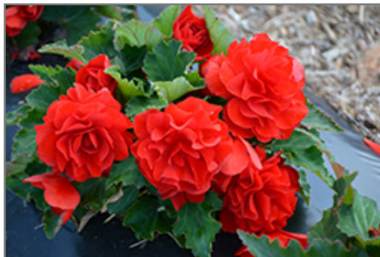
Nonstop Red Begonia in bloom

Nonstop Red Begonia is recommended for the following landscape applications;