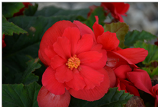
Nonstop Red Begonia flowers