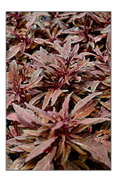
ColorBlaze Velvet Mocha Coleus foliage

ColorBlaze Velvet Mocha Coleus will grow to be about 3 feet tall at maturity, with a spread of 24 inches. When grown in masses or used as a bedding plant, individual plants should be spaced approximately 20 inches apart. It grows at a fast rate, and under ideal conditions can be expected to live for approximately 5 years. As an evegreen perennial, this plant will typically keep its form and foliage year-round.