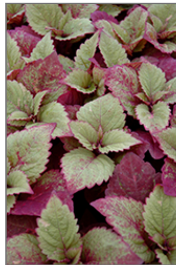
ColorBlaze Royal Glissade Coleus foliage