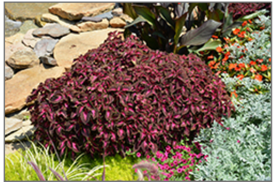
ColorBlaze Kingswood Torch Coleus