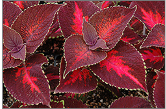
ColorBlaze Kingswood Torch Coleus foliage