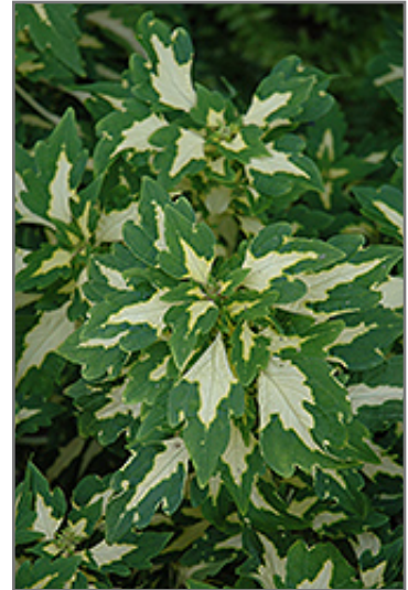
ColorBlaze Alligator Tears Coleus foliage