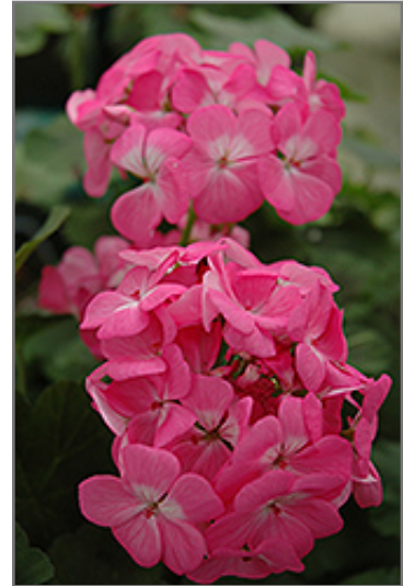
Pillar Pink Geranium flowers