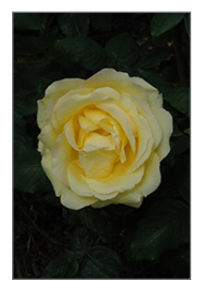
Easy Going Rose flowers