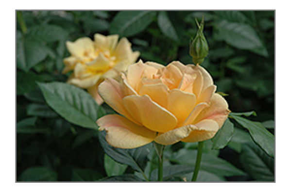
Easy Going Rose flowers