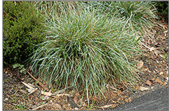
Blue Moor Grass