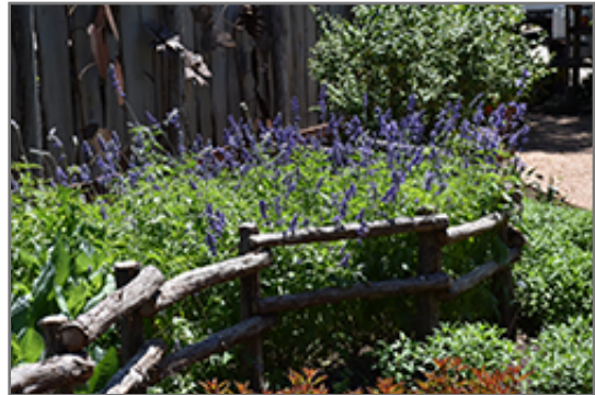
Mealy Cup Sage in bloom