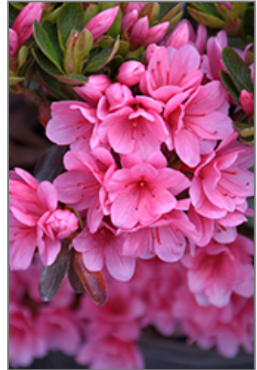
Coral Bells Azalea flowers