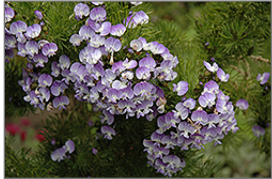
African Scurf Pea flowers

African Scurf Pea is recommended for the following landscape applications;