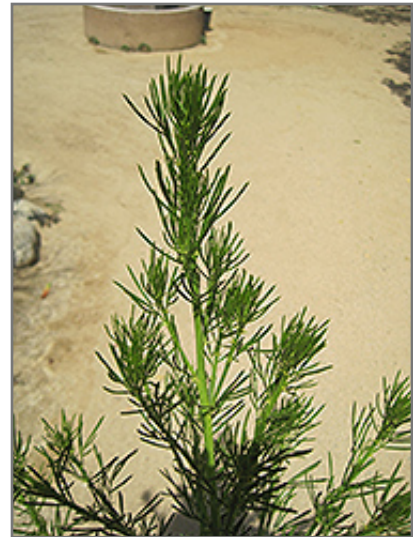
African Scurf Pea foliage

This shrub should only be grown in full sunlight. It does best in average to evenly moist conditions, but will not tolerate standing water. It may require supplemental watering during periods of drought or extended heat. It is not particular as to soil type or pH. It is somewhat tolerant of urban pollution. This species is not originally from North America.