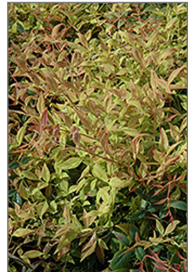
Gulf Stream Dwarf Nandina foliage