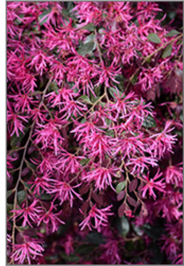
Plum Delight Chinese Fringeflower flowers

Plum Delight Chinese Fringeflower is recommended for the following landscape applications;