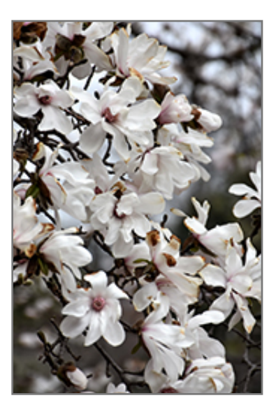
Merrill Magnolia flowers

This tree does best in full sun to partial shade. It requires an evenly moist well-drained soil for optimal growth, but will die in standing water. It may require supplemental watering during periods of drought or extended heat. It is not particular as to soil type, but has a definite preference for acidic soils. It is quite intolerant of urban pollution, therefore inner city or urban streetside plantings are best avoided. Consider applying a thick mulch around the root zone in winter to protect it in exposed locations or colder microclimates. This particular variety is an interspecific hybrid.