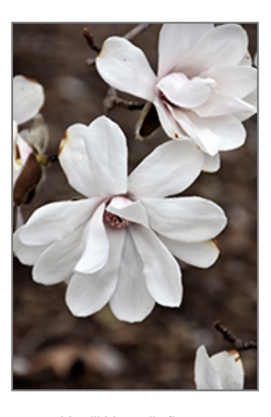
Merrill Magnolia flowers