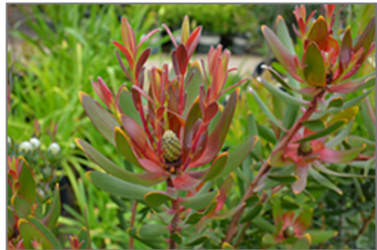
Safari Sunset Conebush flowers