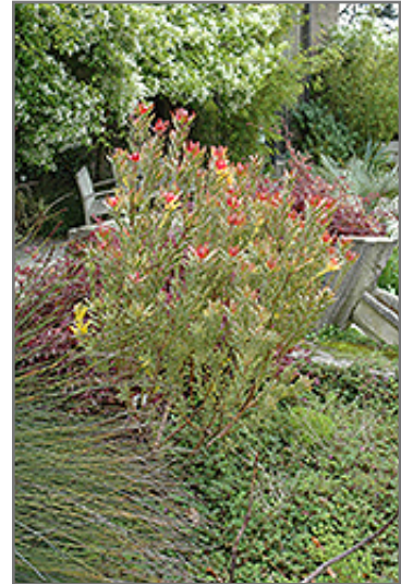
Safari Sunset Conebush

Safari Sunset Conebush makes a fine choice for the outdoor landscape, but it is also well-suited for use in outdoor pots and containers. Its large size and upright habit of growth lend it for use as a solitary accent, or in a composition surrounded by smaller plants around the base and those that spill over the edges. It is even sizeable enough that it can be grown alone in a suitable container. Note that when grown in a container, it may not perform exactly as indicated on the tag - this is to be expected. Also note that when growing plants in outdoor containers and baskets, they may require more frequent waterings than they would in the yard or garden.