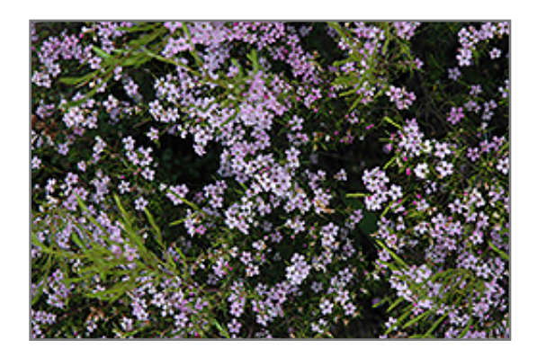
Confetti Bush flowers