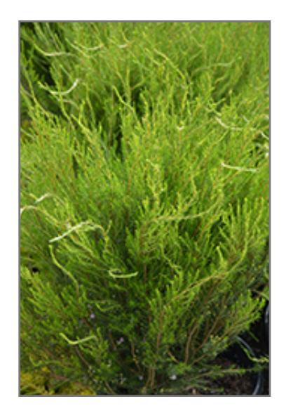
Confetti Bush foliage