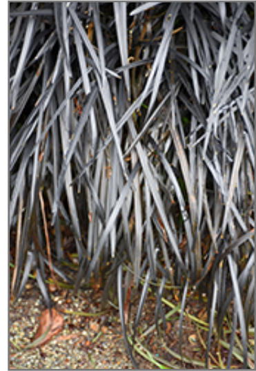
Black Mondo Grass foliage

Black Mondo Grass is a fine choice for the garden, but it is also a good selection for planting in outdoor pots and containers. It is often used as a 'filler' in the 'spiller-thriller-filler' container combination, providing a mass of flowers and foliage against which the thriller plants stand out. Note that when growing plants in outdoor containers and baskets, they may require more frequent waterings than they would in the yard or garden.