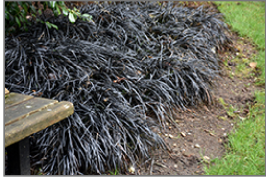
Black Mondo Grass

Black Mondo Grass is recommended for the following landscape applications;