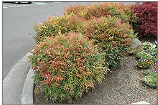
Sienna Sunrise Nandina