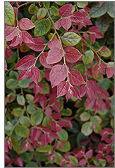
Razzleberri Fringeflower foliage