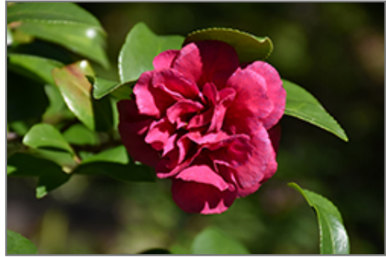
Bonanza Camellia flowers