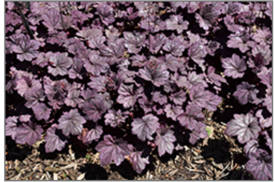
Sugar Plum Coral Bells

Sugar Plum Coral Bells will grow to be about 12 inches tall at maturity extending to 24 inches tall with the flowers, with a spread of 18 inches. When grown in masses or used as a bedding plant, individual plants should be spaced approximately 15 inches apart. Its foliage tends to remain dense right to the ground, not requiring facer plants in front. It grows at a medium rate, and under ideal conditions can be expected to live for approximately 10 years. As an evergreen perennial, this plant will typically keep its form and foliage year-round.