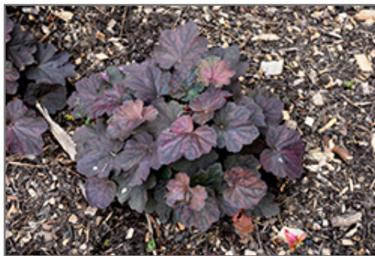
Mocha Coral Bells