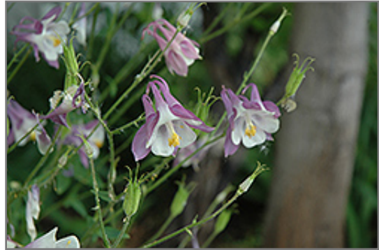
Common Columbine flowers