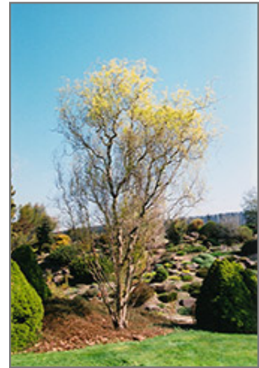
Dragon's Claw Willow in winter