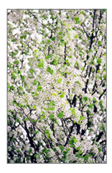
Bradford Ornamental Pear flowers