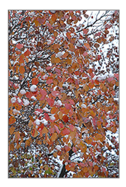
Bradford Ornamental Pear in fall

This tree should only be grown in full sunlight. It prefers to grow in average to moist conditions, and shouldn't be allowed to dry out. It may require supplemental watering during periods of drought or extended heat. It is not particular as to soil type or pH. It is highly tolerant of urban pollution and will even thrive in inner city environments. This is a selected variety of a species not originally from North America.