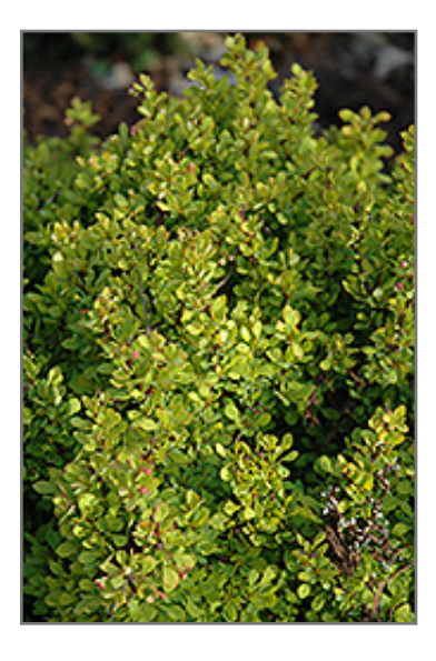
Golden Nugget Japanese Barberry foliage