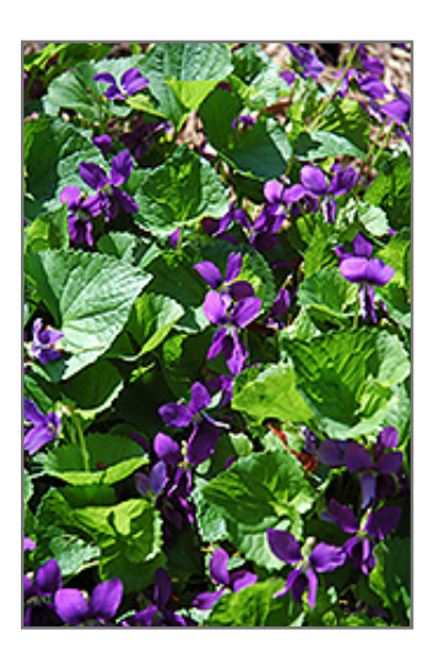
Blue Marsh Violet flowers