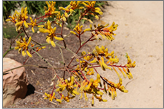
Yellow Gem Kangaroo Paw flowers

Yellow Gem Kangaroo Paw is recommended for the following landscape applications;