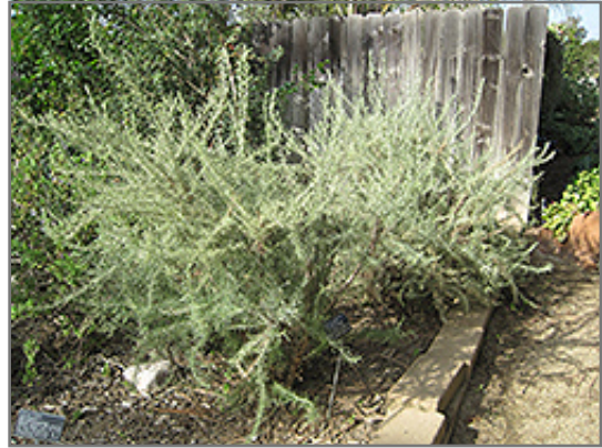
California Sagebrush

California Sagebrush is recommended for the following landscape applications;