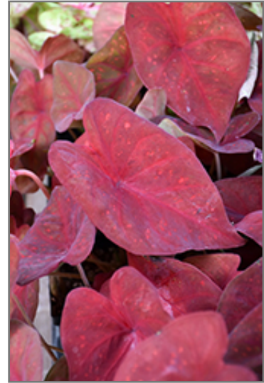
Burning Heart Caladium foliage

Burning Heart Caladium is recommended for the following landscape applications;