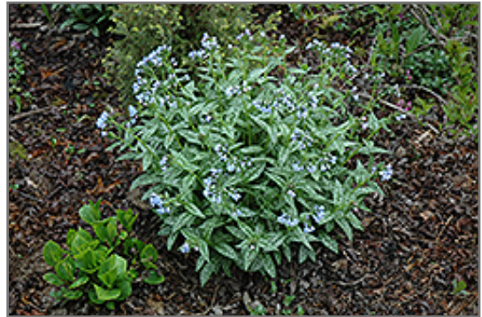
Roy Davidson Lungwort in bloom