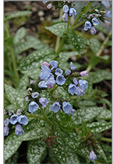
Roy Davidson Lungwort flowers