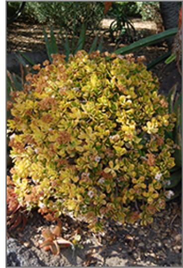
Hummel's Sunset Golden Jade Plant in bloom

Hummel's Sunset Golden Jade Plant is a multi-stemmed evergreen shrub with an upright spreading habit of growth. Its average texture blends into the landscape, but can be balanced by one or two finer or coarser trees or shrubs for an effective composition.