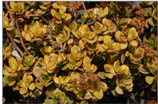
Hummel's Sunset Golden Jade Plant foliage