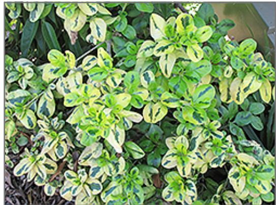
Taupata Gold Mirror Bush