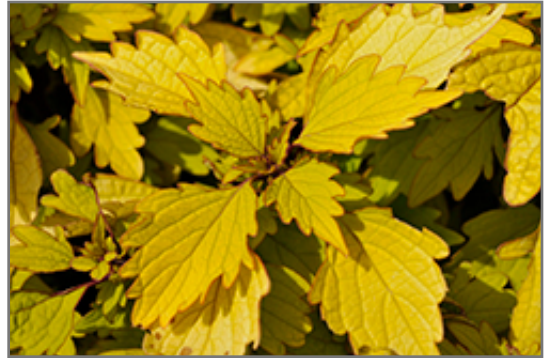
ColorBlaze Royale Pineapple Brandy Coleus foliage

ColorBlaze Royale Pineapple Brandy Coleus is recommended for the following landscape applications;