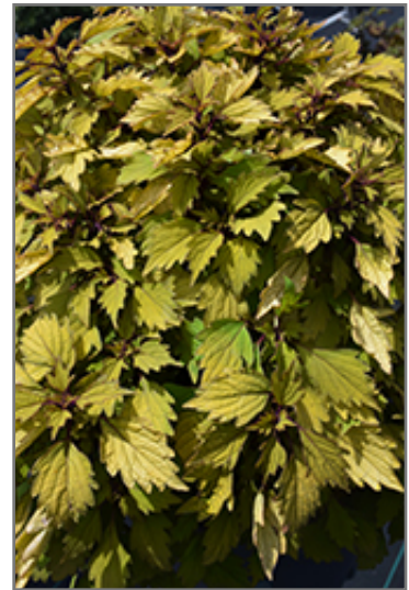
ColorBlaze Royale Pineapple Brandy Coleus foliage