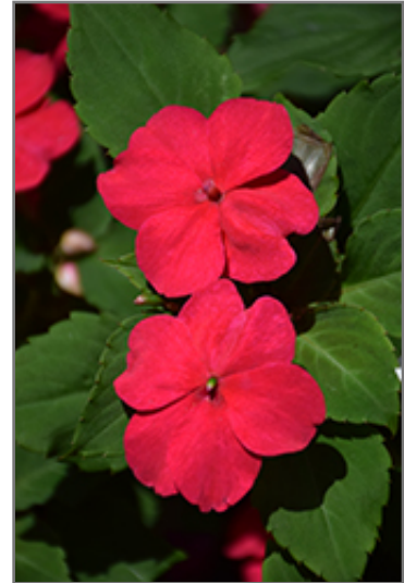
Imara XDR Rose Impatiens flowers

Imara XDR Rose Impatiens is recommended for the following landscape applications;