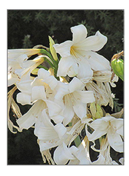
White Belladonna Lily flowers

White Belladonna Lily is recommended for the following landscape applications;