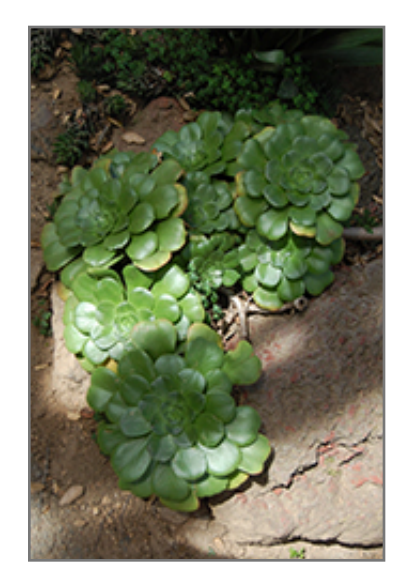
Green Platters