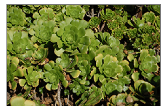
Green Platters