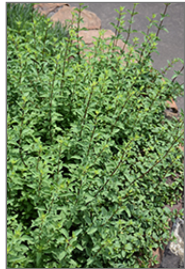
Hopley's Oregano