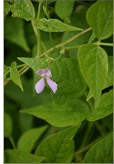
Golden Wax Bean flowers

Golden Wax Bean will grow to be about 10 feet tall at maturity, with a spread of 24 inches. When planted in rows, individual plants should be spaced approximately 12 inches apart. Because of its vigorous growth habit, it may require staking or supplemental support. This fast-growing vegetable plant is an annual, which means that it will grow for one season in your garden and then die after producing a crop. Because of its relatively short time to maturity, it lends itself to a series of successive plantings each staggered by a week or two; this will prolong the effective harvest period.