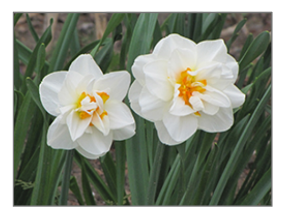
Double Poet's Daffodil flowers