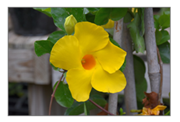
Yellow Mandevilla flowers

This plant is native to the tropics and prefers growing in moist environments with evenly warm conditions all year round. In our climate, it is usually grown as an outdoor annual in the garden or in a container. If you want it to survive the winter, it can be brought in to the house and provided with special care, and then returned to the garden the following season. In its preferred tropical habitat, as a shrub it can grow to be around 10 feet tall at maturity, with a spread of 24 inches. However, when grown as an annual or when overwintered indoors, it can be expected to perform quite differently, and its exact height and spread will depend on many factors; you may wish to consult with our experts as to how it might perform in your specific application and growing conditions.