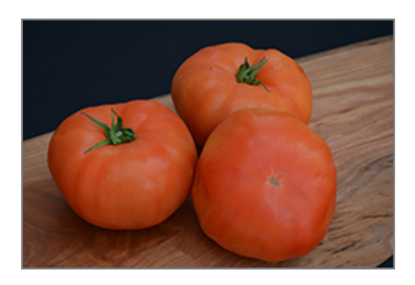
Classic Beefsteak Tomato fruit

Classic Beefsteak Tomato will grow to be about 6 feet tall at maturity, with a spread of 24 inches. When planted in rows, individual plants should be spaced approximately 3 feet apart. Because of its vigorous growth habit, it may require staking or supplemental support. This fast-growing vegetable plant is an annual, which means that it will grow for one season in your garden and then die after producing a crop.