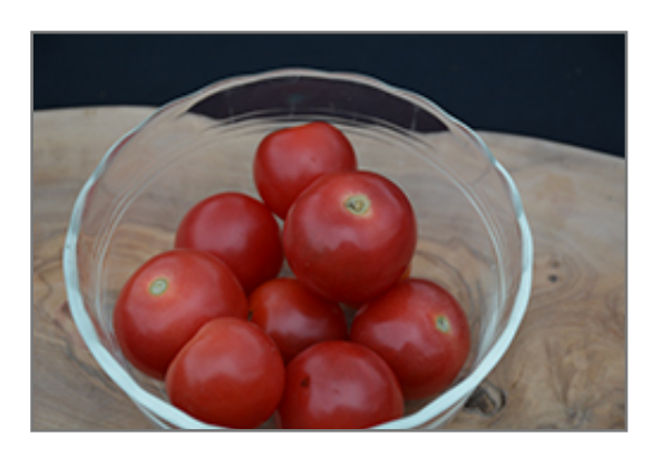
Husky Red Cherry Tomato fruit

Husky Red Cherry Tomato will grow to be about 24 inches tall at maturity, with a spread of 24 inches. When planted in rows, individual plants should be spaced approximately 3 feet apart. This fast-growing vegetable plant is an annual, which means that it will grow for one season in your garden and then die after producing a crop.