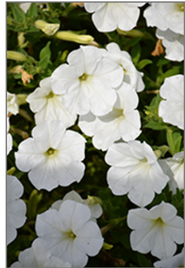
ColorRush White Petunia flowers