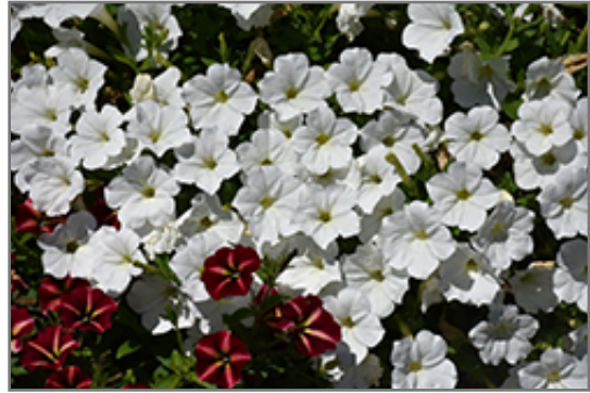
ColorRush White Petunia flowers

ColorRush White Petunia is recommended for the following landscape applications;