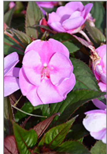
SunPatiens Vigorous Lavender Splash New Guinea Impatiens flowers